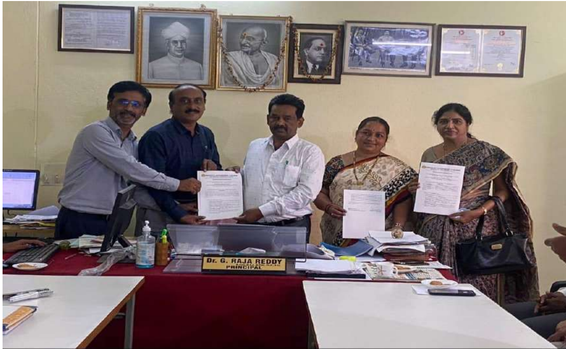
MOU with Pingle GDC (W) – Faculty of both colleges exchanging the document