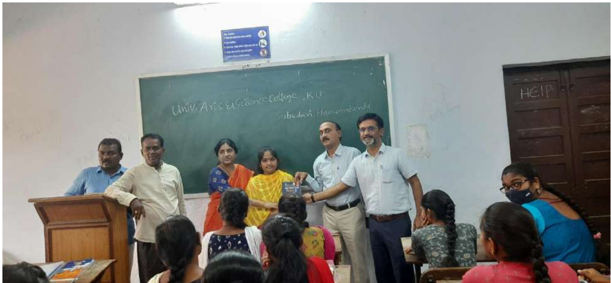
Distribution of books to the students